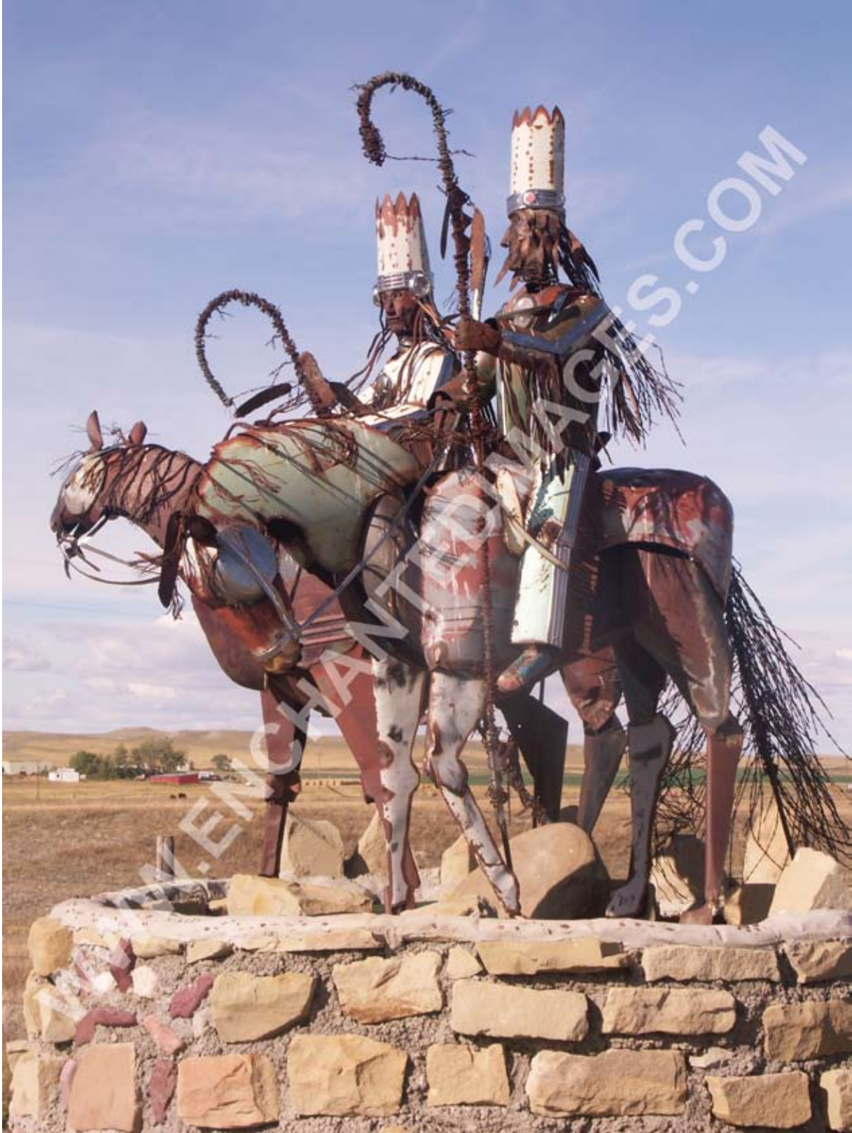
American Indian Sculpture Outside Glacier Park

NOTE: WATERMARKS APPEAR ON SAMPLE IMAGES ONLY