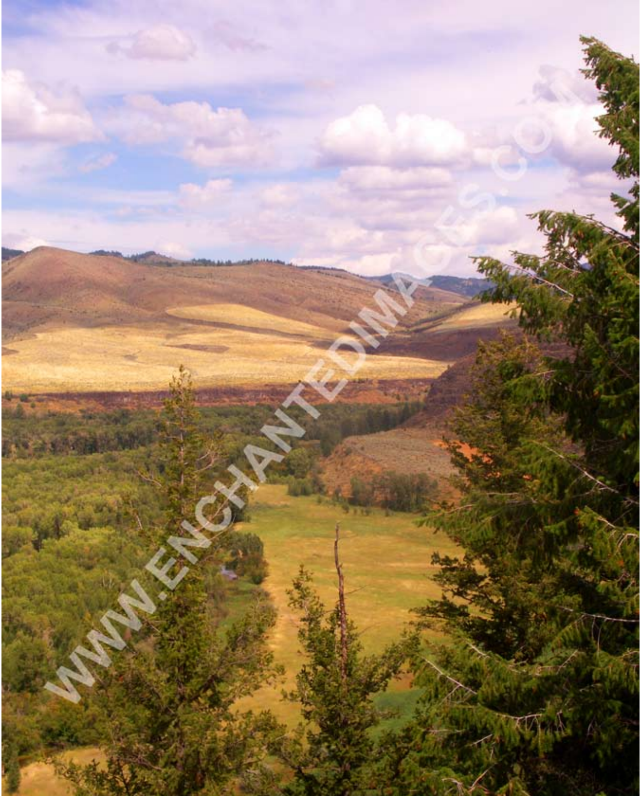
Summer Afternoon In Yellowstone