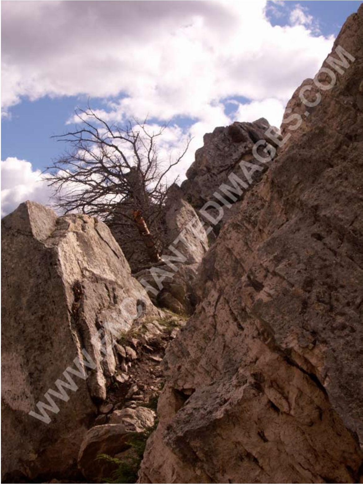
Cliff Near Mammoth