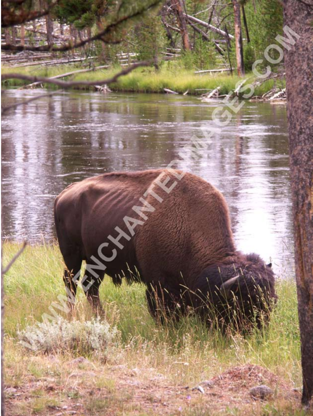
Bison on the Yellowstone River