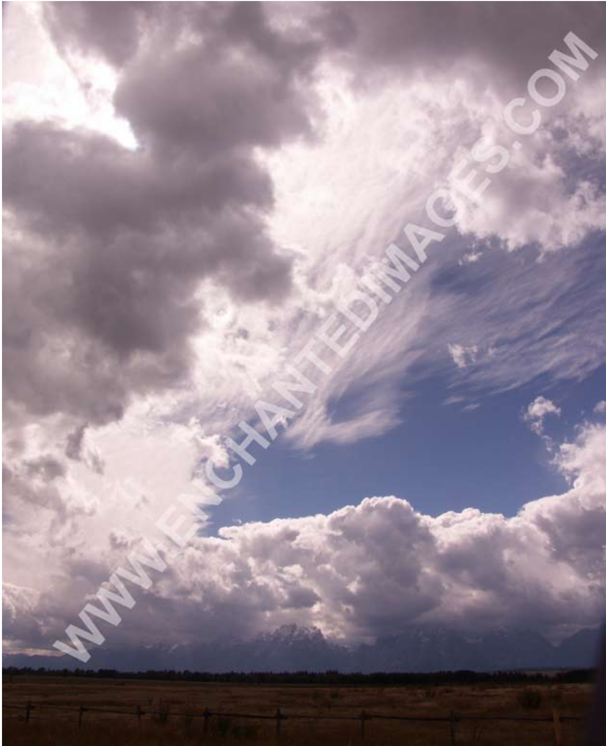
Storm Clouds Over the Grand Tetons