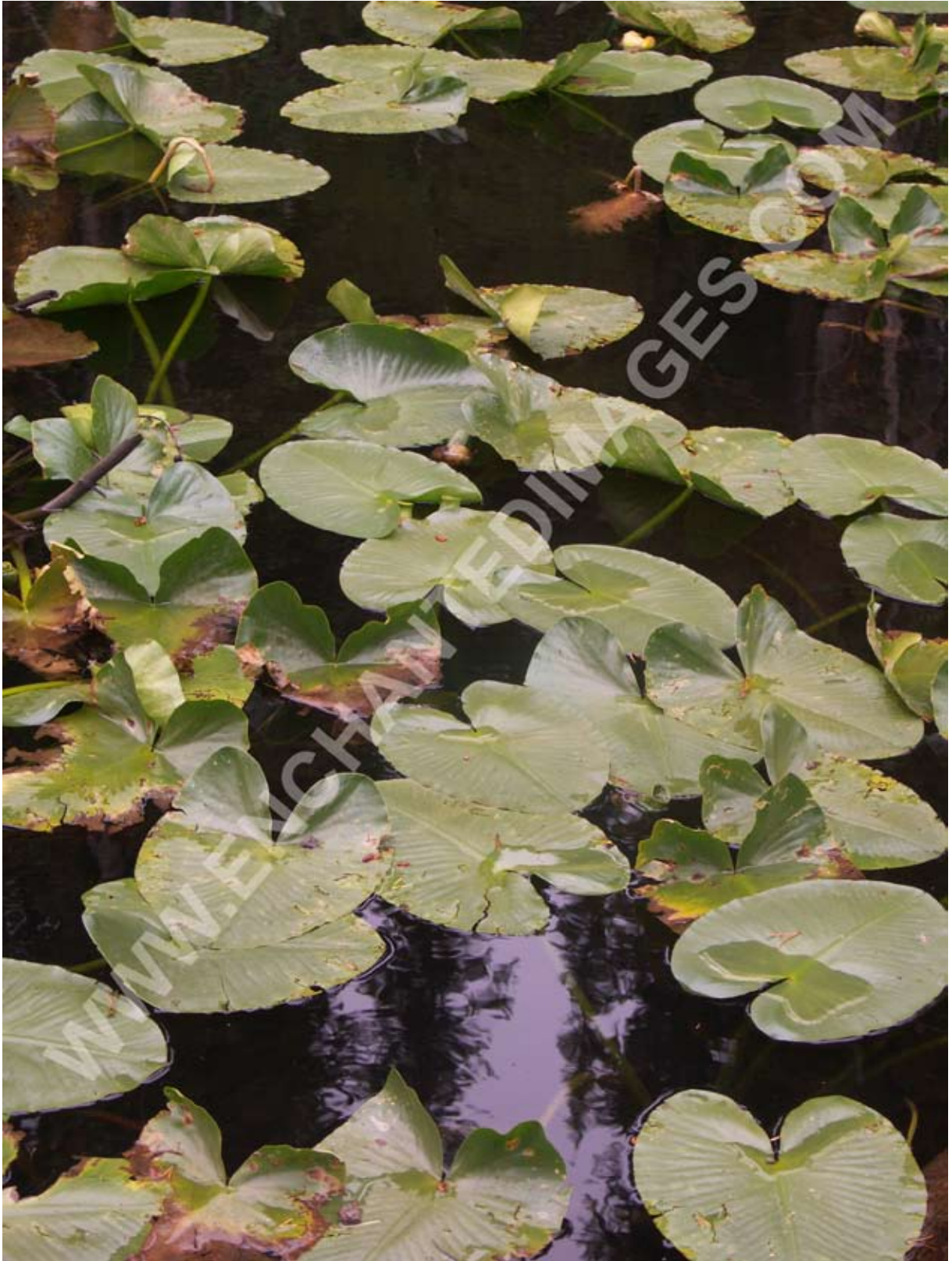
Lillies on the Great Divide