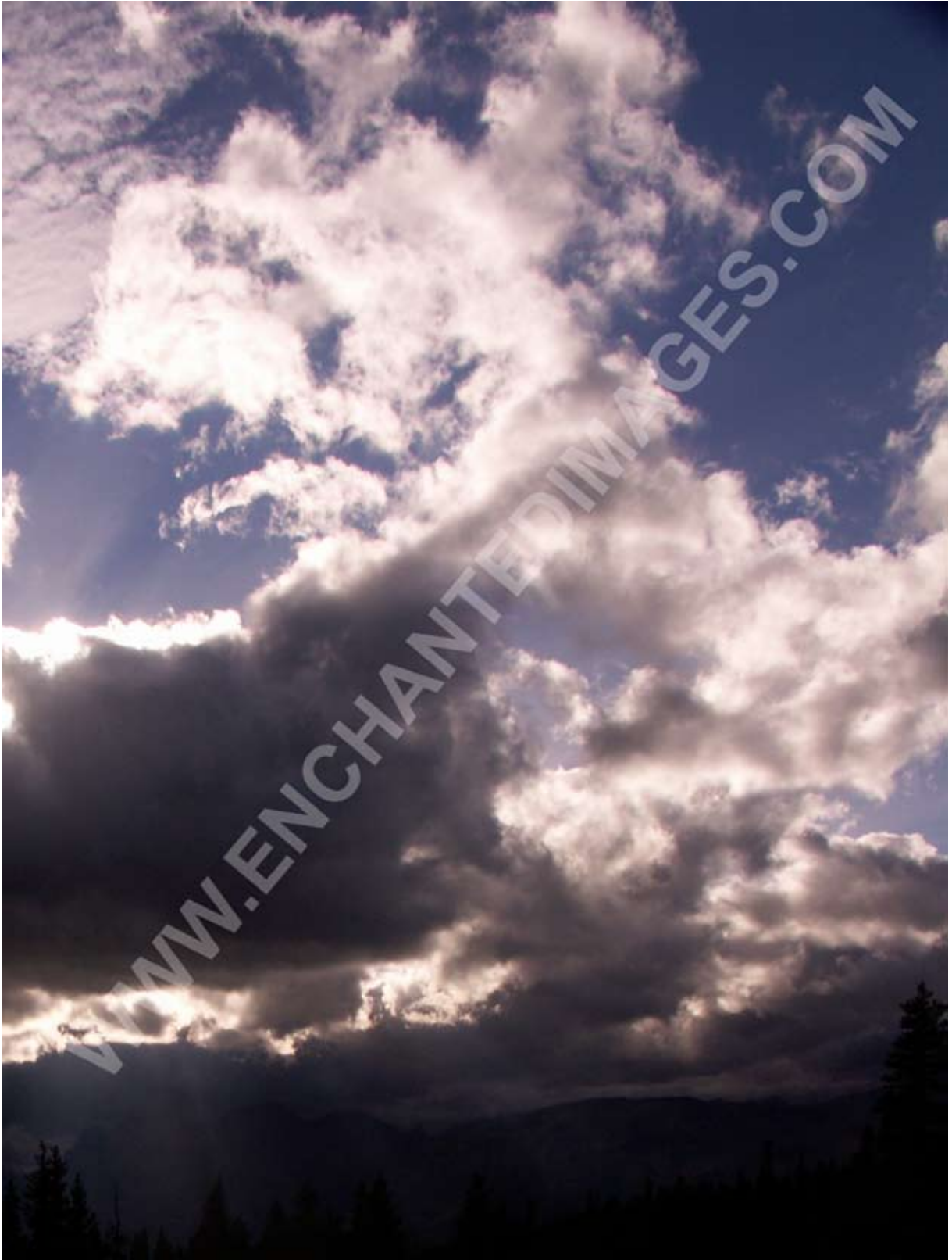
Dark Clouds Over Glacier